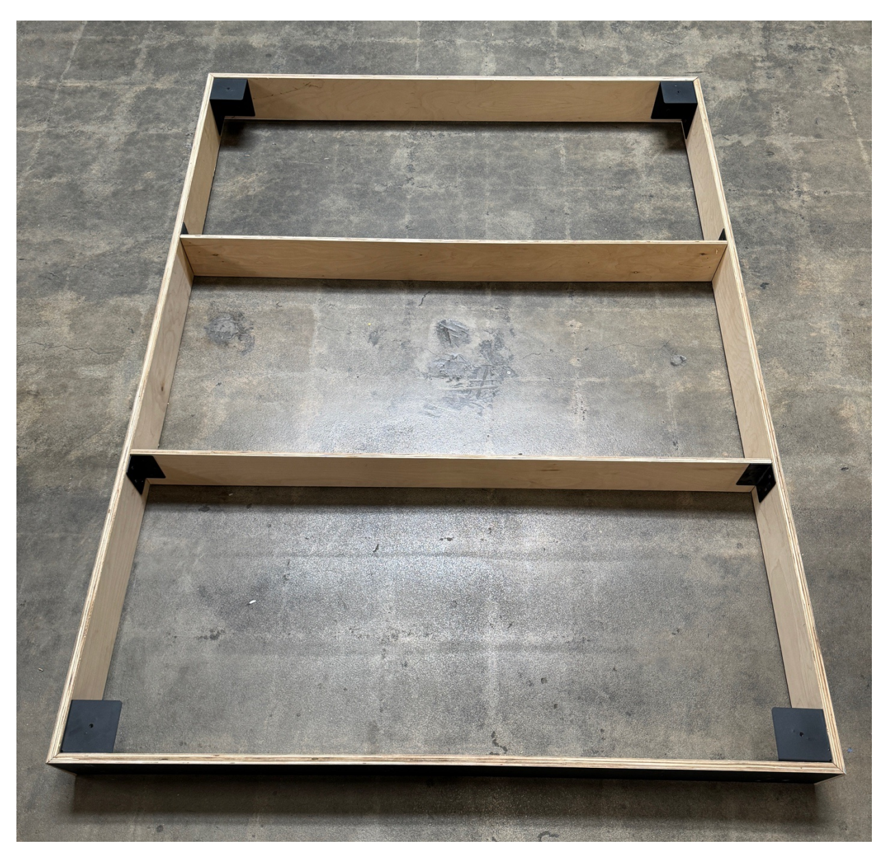
ONCE FLAT ON GROUND, TIGHTEN ALL SCREWS AND BOLTS!